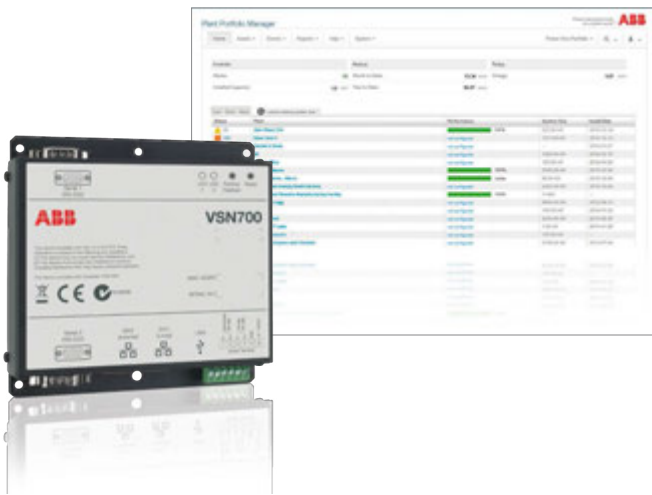
VSN700 Data Logger and web user interface

Sold in India by: Loop Solar Call: +91-9971136369 Email: info@loopsolar.com Web: www.loopsolar.com