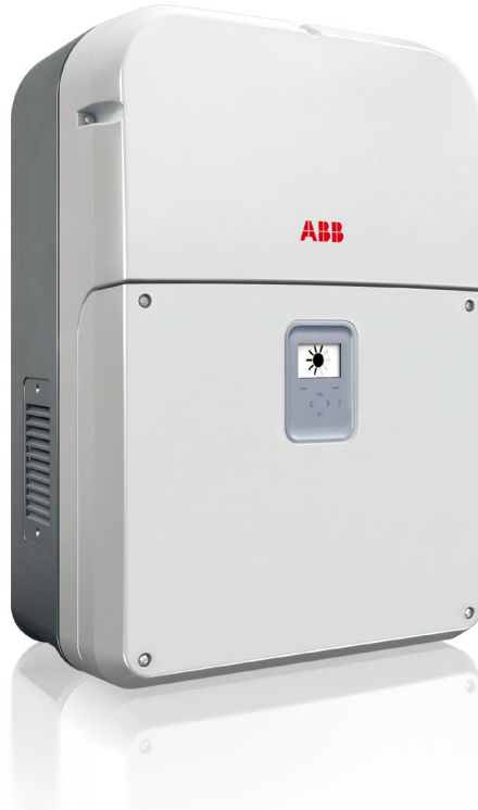
ABB string inverters cost-efficiently convert the direct current (DC) generated by solar modules into high quality three-phase alternating current (AC) that can be fed into the power distribution network (i.e. grid). Designed to meet the needs of the entire supply chain – from system integrators and installers to end users – these transformerless, three-phase inverters are designed for decentralized photovoltaic (PV) systems installed in commercial and industrial systems up to megawatt (MW) sizes.