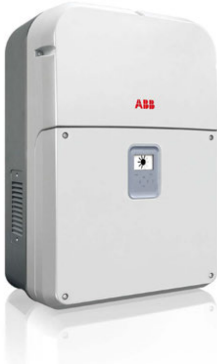
ABB string inverters cost-efficiently convert the direct current (DC) generated by solar modules into high quality three-phase alternating current (AC) that can be fed into the power distribution network (i.e. grid). Designed to meet the needs of the entire supply chain – from system integrators and installers to end users – these transformerless, three-phase inverters are designed for decentralized photovoltaic (PV) systems installed in commercial and industrial systems up to megawatt (MW) sizes.