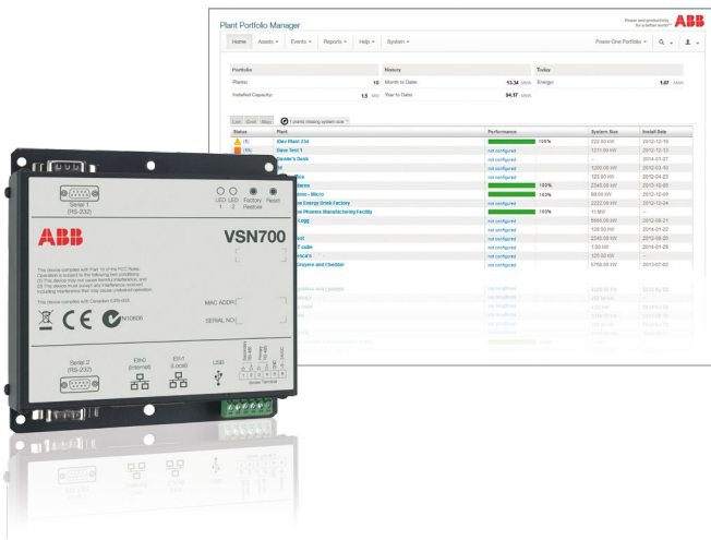
VSN700 Data Logger and web user interface

Sold in India by: Loop Solar Call: +91-9971136369 Email: info@loopsolar.com Web: www.loopsolar.com